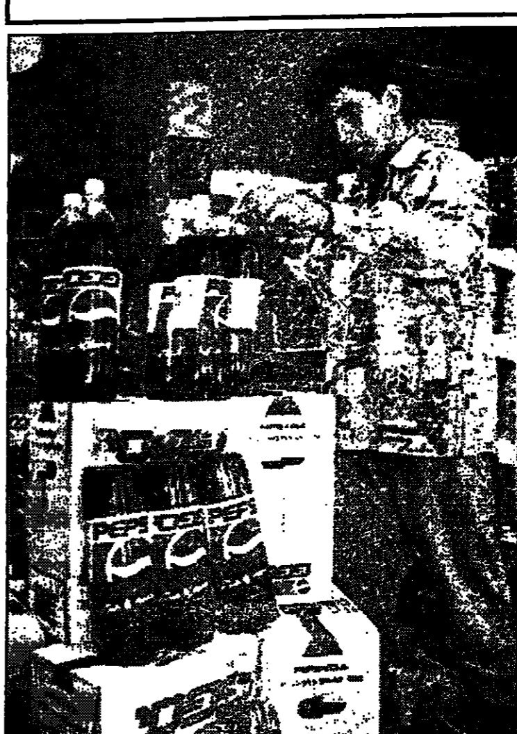
A Palestinian shop clerk arranges a display of Pepsi Cola bottles in an Al-Bireh store, after the Palestinian Authority gave merchants until tomorrow to get rid of their stocks or have them seized. The PA temporarily banned Pepsi sales after discovering a defective shipment was distributed in the territories.